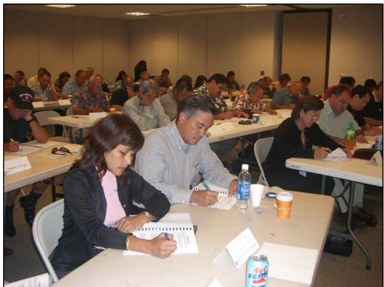
Image 1: Ethics in the Public Sector participants work on an ethics-related dilemma on April 26, 2006.

During the preparation of this course, we received an overwhelming response from required participants and other individuals requesting to attend this training. With both classes already filled to capacity, we were unable to accommodate other interested people. We were pleased with the overwhelming response and it is gratifying to know that so many elected and appointed leaders were and are willing to take part in the ethics course. Based on the responses, we recommend this training be afforded to all government of Guam employees and especially mid-level managers.