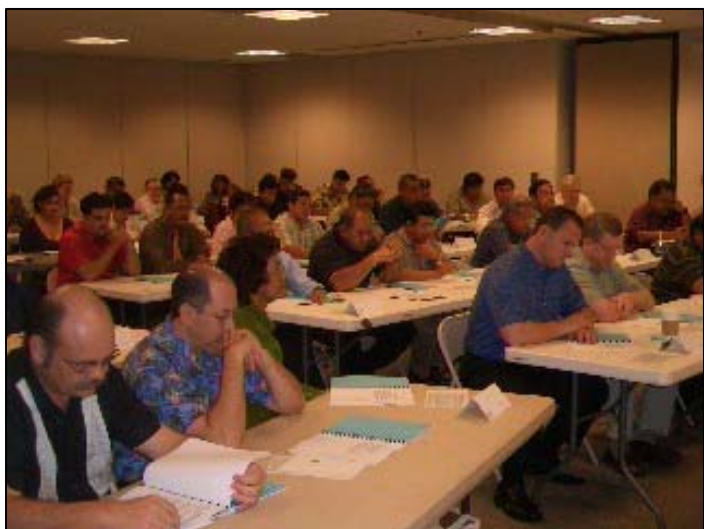
Image 2: Ethics in the Public Sector participants work on an ethics-related dilemma on April 24, 2006

Although we appreciate the opportunity to hold this training, it would be more appropriate that such training be administered by the Department of Administration's Training and Development division, UOG, or GCC.