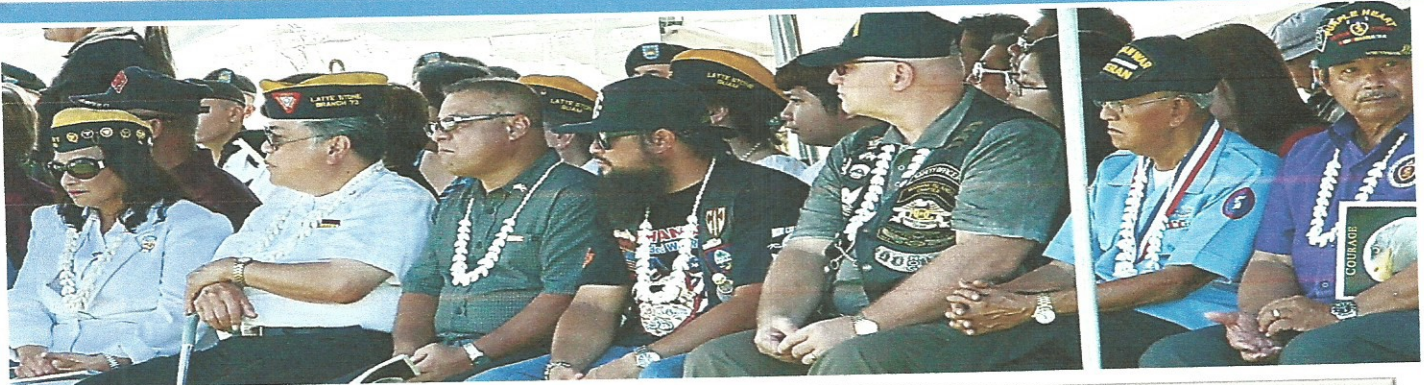
Guam Veteran Affairs Expenditures