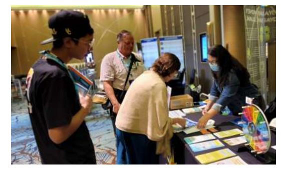
7th Assembly of Planners Symposium, GEO Outreach Booth, 8/17/2022, Dusit Thani Guam