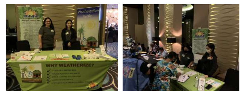
46th Annual Gov's Guam Conference on Aging Vaccine& Booster Clinic, GEO Outreach Booth, 6/30/22, Dusit Thani Guam