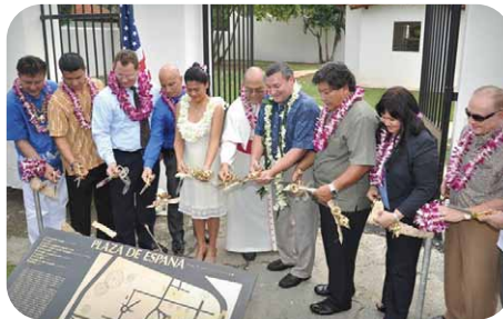
Ribbon Cutting Ceremony for the rehabilitated Plaza de España in Hagatna took place in December 2013.

GEDA's Real Property Division oversees numerous multimillion dollar projects and programs and manages two industrial parks: The E.T. Calvo Memorial Park and the Harmon Industrial Park, generating jobs and millions of dollars in revenue to the island. RPD is also charged with managing $55 million in capital improvement projects funded through the 2011 Hotel Occupancy Tax Bond (HOT Bond). These projects include the renovation and restoration of cultural and historic sites throughout the island, and include the construction of the Guam Chamorro Education Facility (Guam Museum).