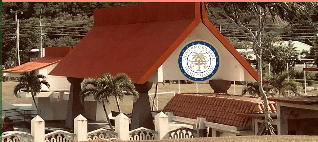
Setbision Manina Yan Minanehan Gusto