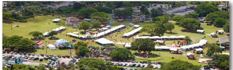
Governor Joseph Flores Memorial Park Enhancements (Ypao Beach)