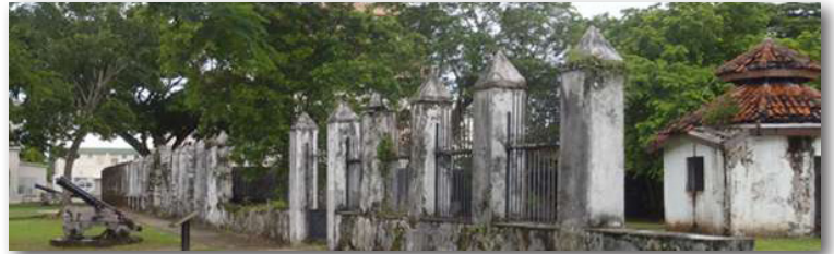
Restoration of Plaza de España