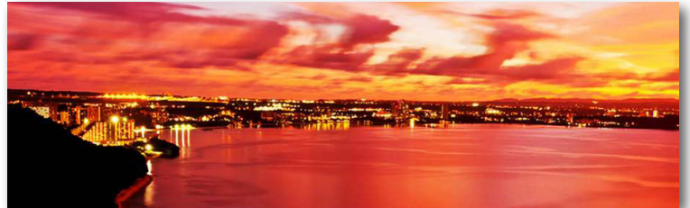
Hagåtña Vicinity Street Light Installation