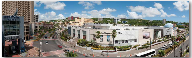
San Vitores Road Flooding Mitigation