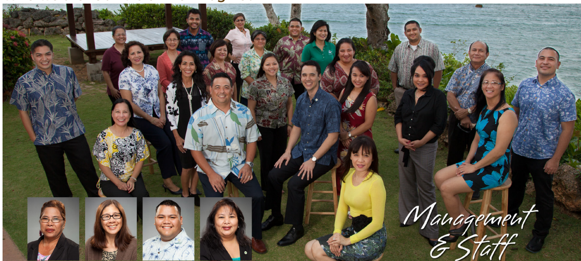
Management & Staff of the Guam Visitors Bureau - Setbision Bisitan Guåhan.

The Guam Visitors Bureau was established in 1963 as the Guam Tourist Commission under the auspice of the Guam Department of Commerce, signaling the beginning of the Tourism Industry on the tropical island. In 1970, the commission was renamed to the Guam Visitors Bureau, and re-established as a public non-stock, non-profit membership corporation to promote Guam as a visitor destination. GVB is funded by the Tourist Attraction Fund and membership dues (less than 1% of total funding).