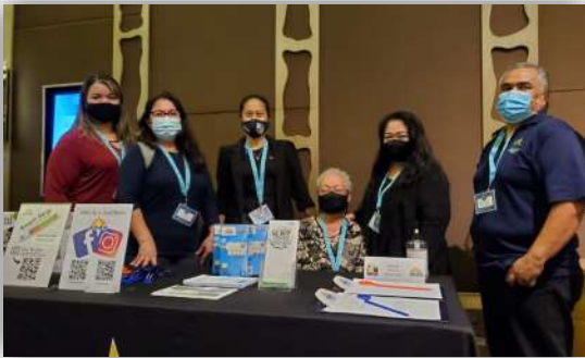
6th Assembly of Planners Symposium, GEO staff and management, 2/18-19/2021