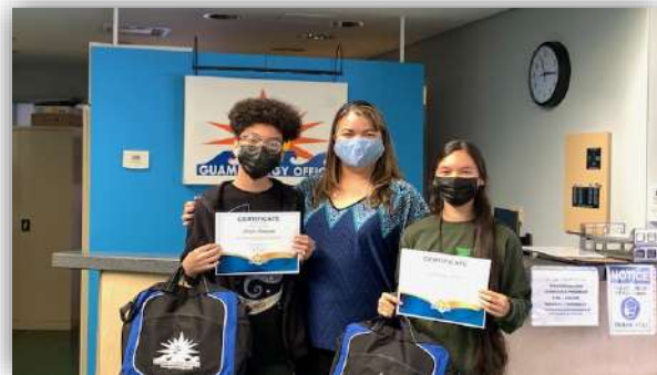
GEO Director and Summer Interns, 8/19/21