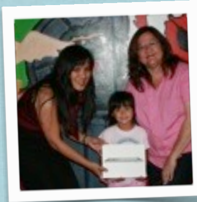
PBS GUAM/KGTF takes its pledge night to the capital city of Hagatna. TGIFriday's hosted the station's pledge drive.

Winner of the 2011 Ipad for the station's annual Family Read-A-Thon.